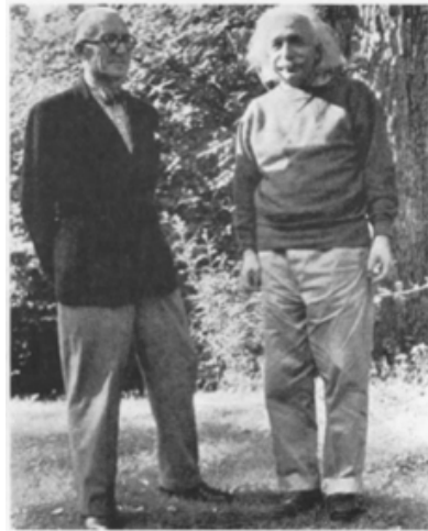
Fig. 3. Meeting Albert Einstein – Le Corbusier in Princeton (USA), 1945. Picture from vol.4 of Œuvres Complètes de Le Corbusier, 1938-1946

Construction, as a discipline related to architectural and urban design and production, refers to its own sciences and techniques. Geometry, stereotomy, statics, and strength of materials 13 are usually intended as “building sciences” while “building techniques” refer to the overall methods and systems, empirically or scientifically established, that belong to programming and constructing. Construction is not limited to the action of erecting a structure ( struere ), but includes all the choices related to materials that occur during the design and building phases: their dimensioning, their shaping, and their assembling in the whole structure. In French, the techniques (plural) are considered to be a subset of construction, which, in turn, is a part of the technique (singular), 14 which includes comfort and environmental aspects (thermal, acoustic, lighting), equipment and modern communication systems (network, home automation).