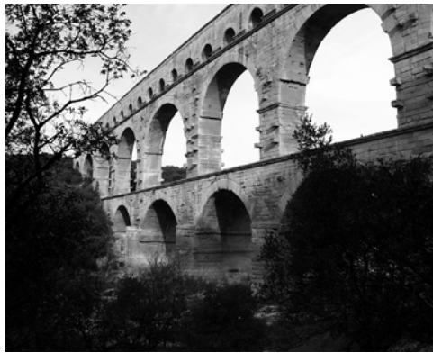
Fig. 2. The pont du Gard today.